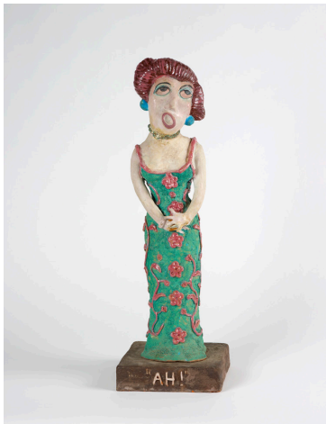
Beatrice Wood Ah! , 1967 Stoneware, 39 x 9 x 8 1/2 inches Gift of the artist