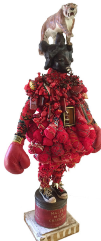
Vanessa German The Boxer , 2016 Mixed-media assemblage, 78 x 38 x 22 inches