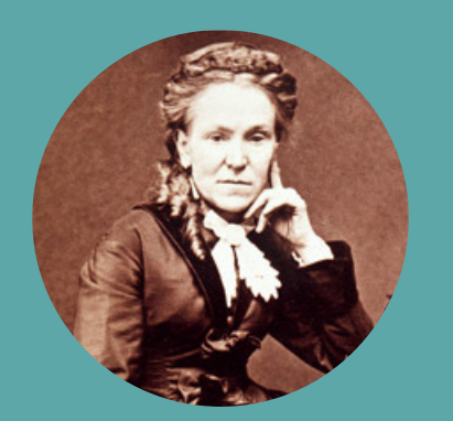
Matilda Joslyn Gage

Women's Suffrage is the right of women to vote and to hold an elected office. In the US women were not allowed to vote until 1920.