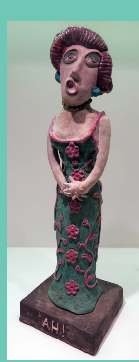
Ah!, 1967 by Beatrice Wood

Which part of the singing sculpture do you think has a matte surface and which has a glossy surface?