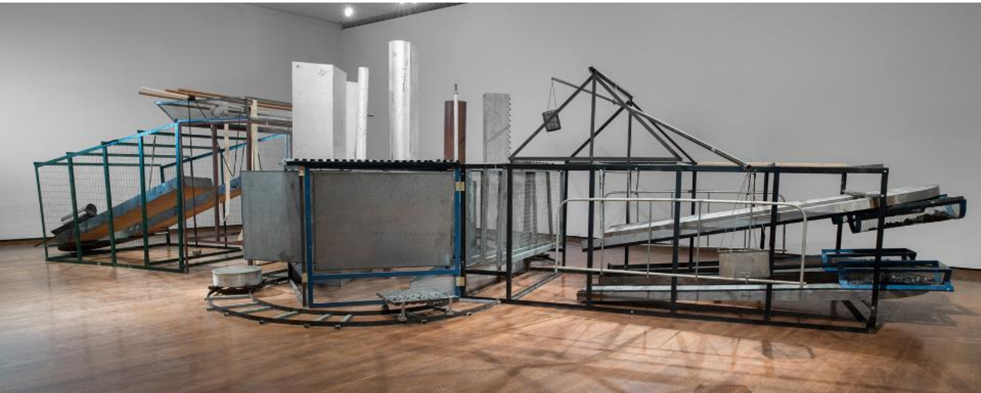
Dennis Oppenheim American (1938-2011) Impulse Reactor (A Device for Detecting, Entering, Converting Past Lies Traveling Underground and in the Air) , 1980