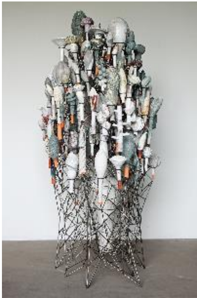
David Hicks Pale Shrub , 2015 Glazed earthenware and stainless steel

A few of the works of art you'll see in the ceramics collection: