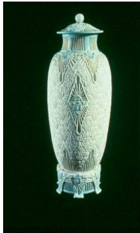
Adelaide Robineau Scarab Vase , 1910 Porcelain