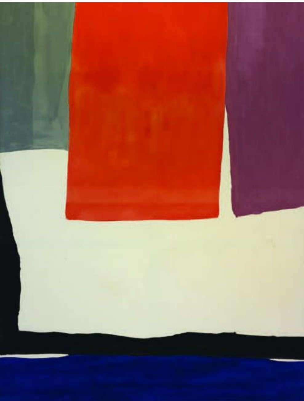
Helen Frankenthaler, American (1928-2001), The Human Edge , 1967 Acrylic on canvas