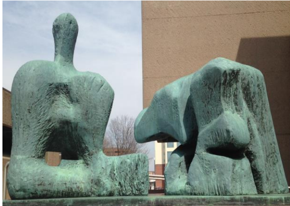
Henry Moore, English (1898-1986) Two Piece Reclining Figure no. 3 Bronze