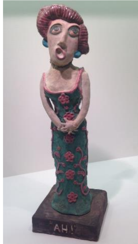
Beatrice Wood, American (1893-1998) Ah! , 1962 Stoneware