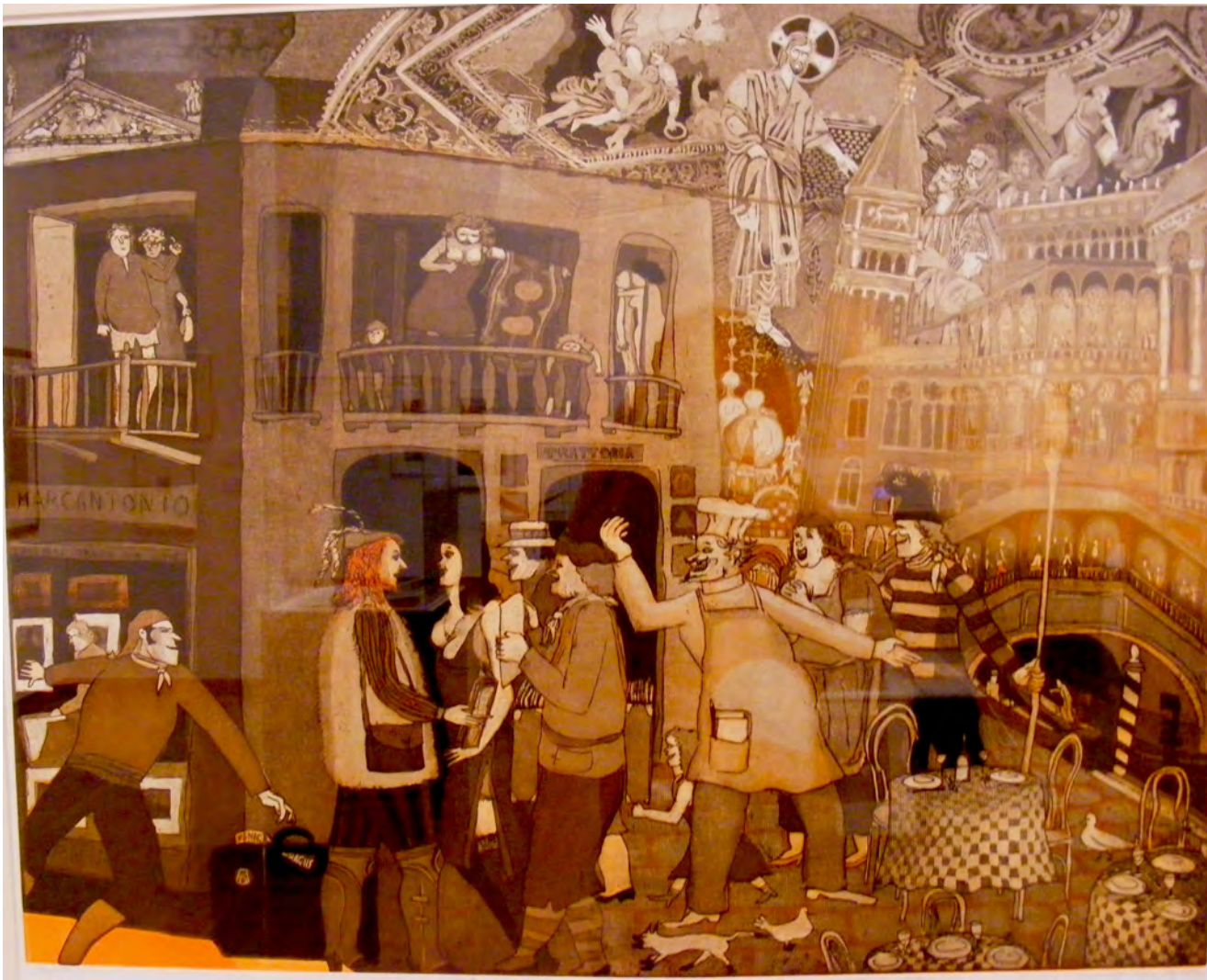
Warrington Colescott, American (b 1921), Dürer, at 23, in Venice, in Love, His Bags are Stolen , 1976, Color etching aquatint on wove paper, SUArt Galleries, Syracuse University, Collection purchase, 1978.66