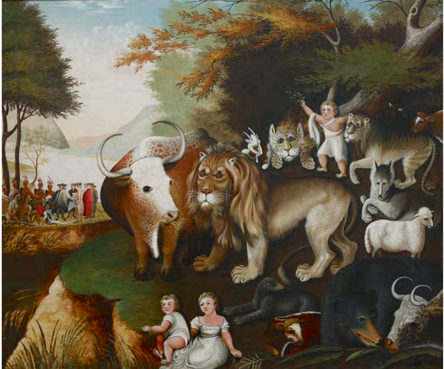
Edward Hicks, American (1780-1849), The Peaceable Kingdom , ca. 1840-1844, Oil on wood panel, Everson Museum of Art purchase, 78.19