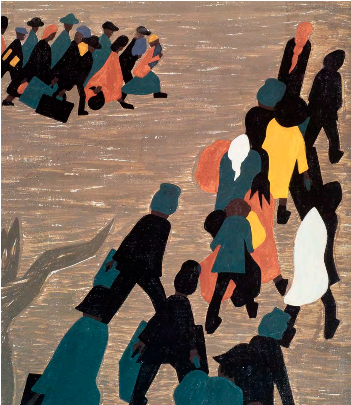
Jacob Lawrence, American (1917-2000) Jacob Lawrence: The Migration Series , 1993, Book. Special Collections Research Center, Syracuse University Library, NC975.L42 M53 1993f