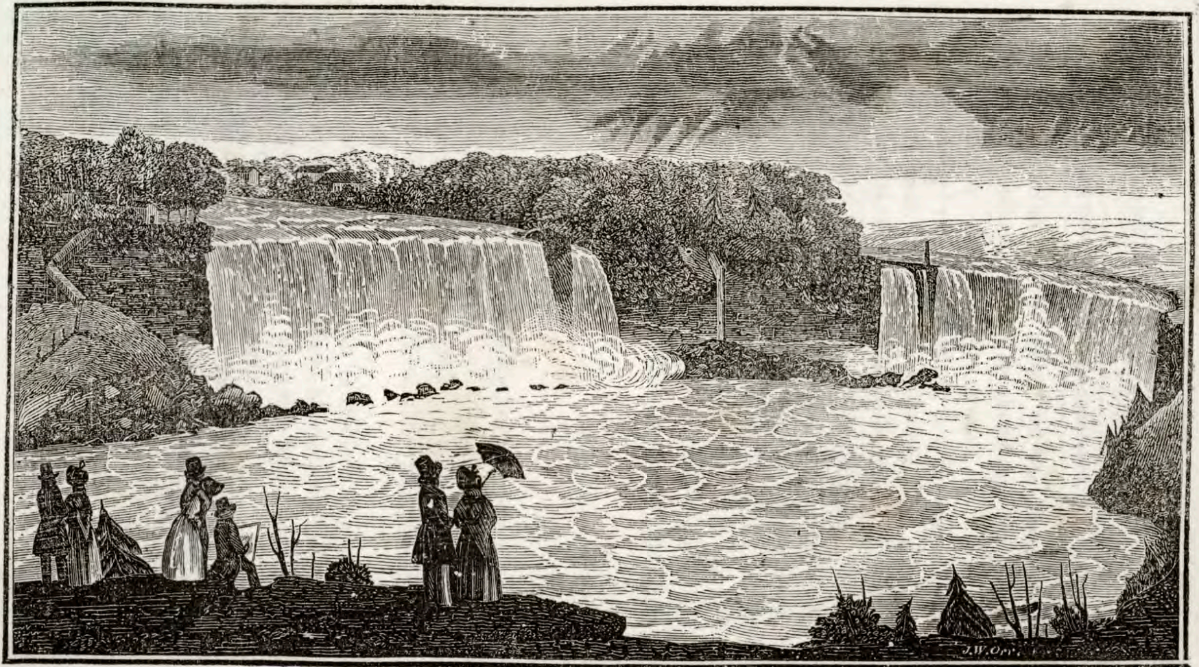
Niagara Falls, from Canada near the Clifton House.