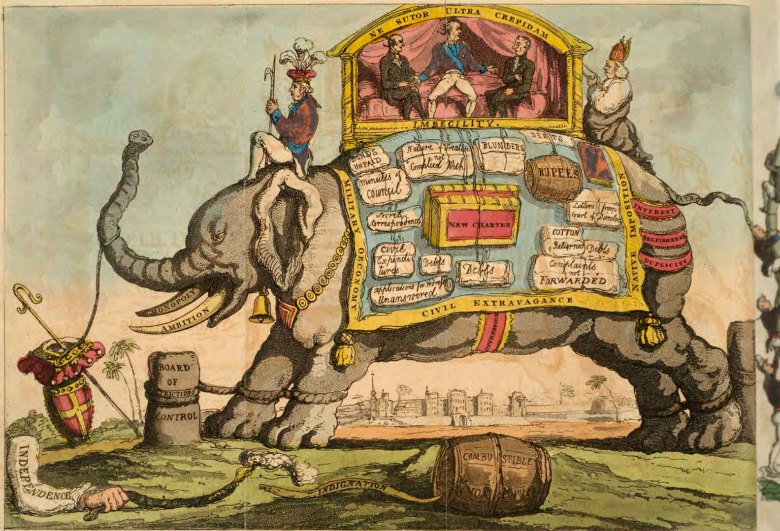
A NEW MAP OF INDIA FROM THE LATEST AUTHORITY.

London Published by T. Tegg, 37 III. Chesapeake, Oct. 1. 1815.