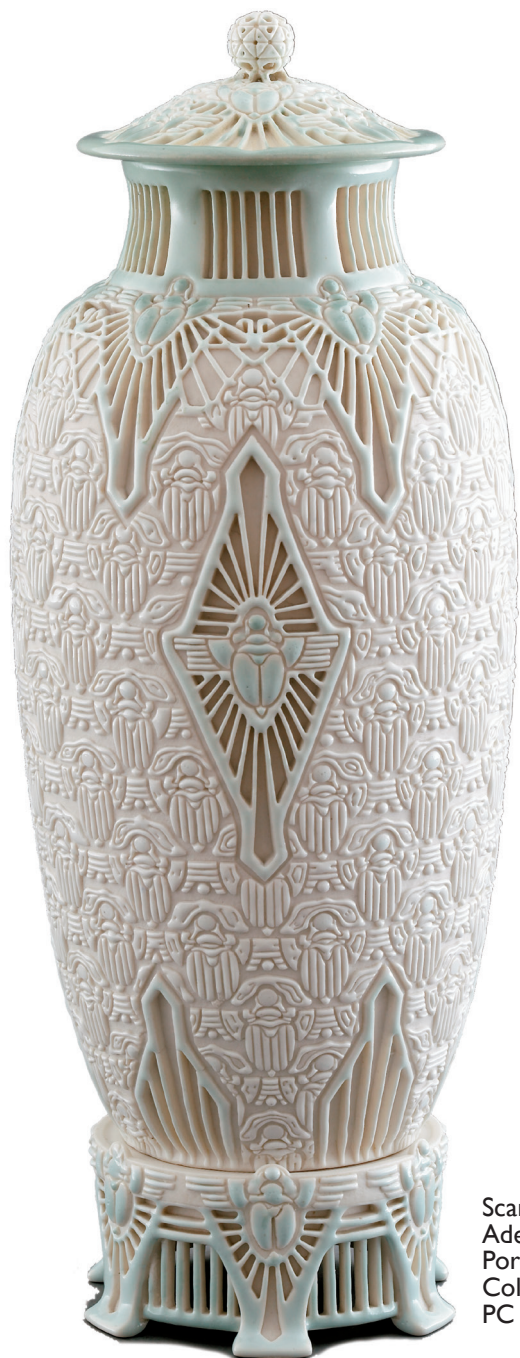
Scarab Vase, 1911 Adelaide Alsop Robineau Porcelain, 16 5/8 x 6 in. diameter. Collection Everson Museum of Art, PC 30.4.78a,b,c