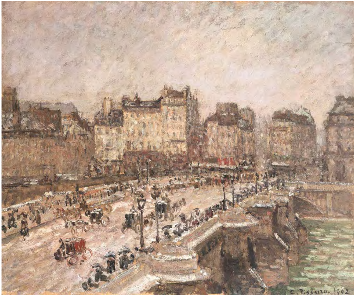
Camille Pissarro Pont Neuf, Snow Effect, 2nd Series, 1902