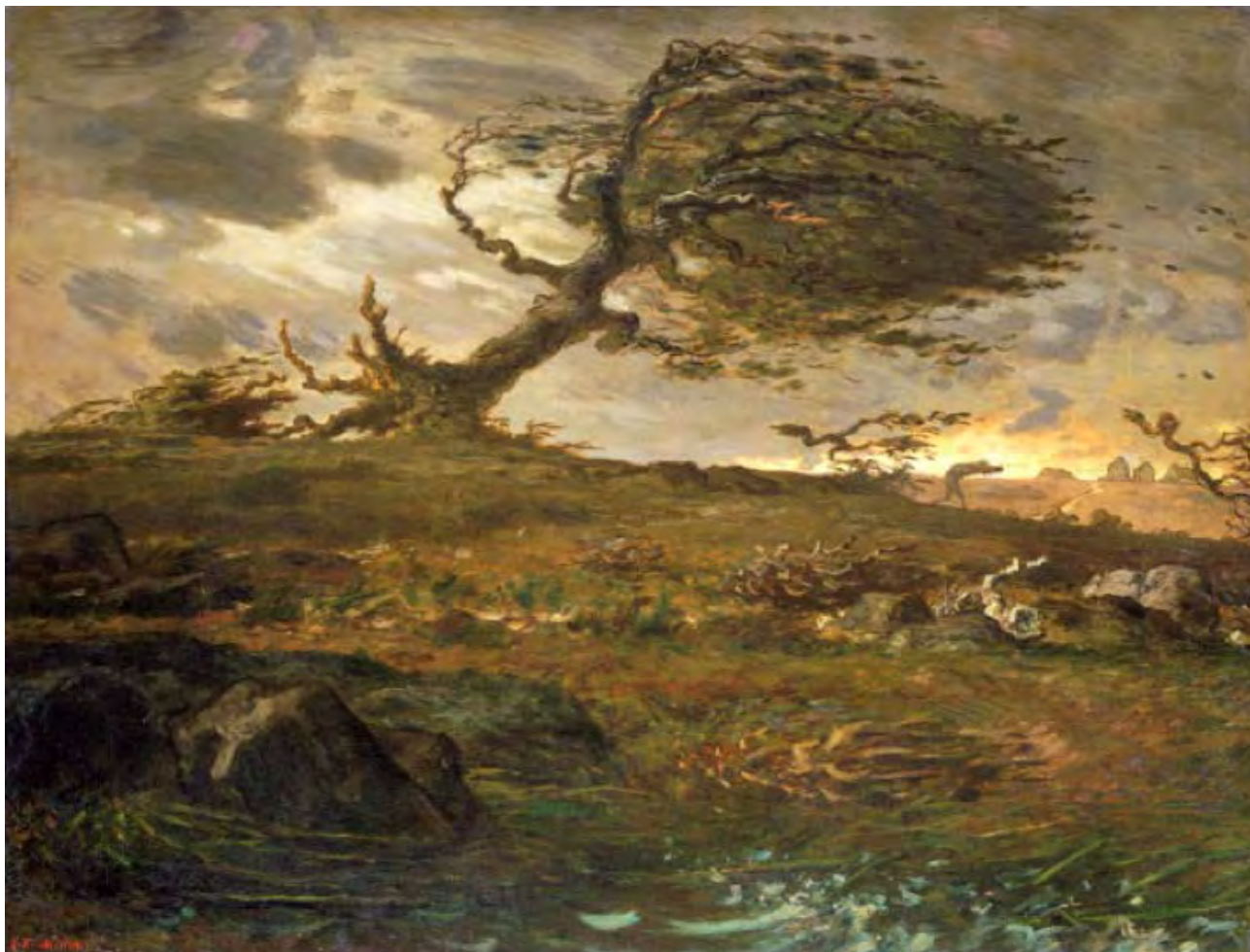
Jean-François Millet The Gust of Wind , 1871–73 Oil on canvas, 35 x 46 1/8 in. National Museum of Wales; Miss Margaret S. Davies Bequest, 1963 (NMWA 2475)