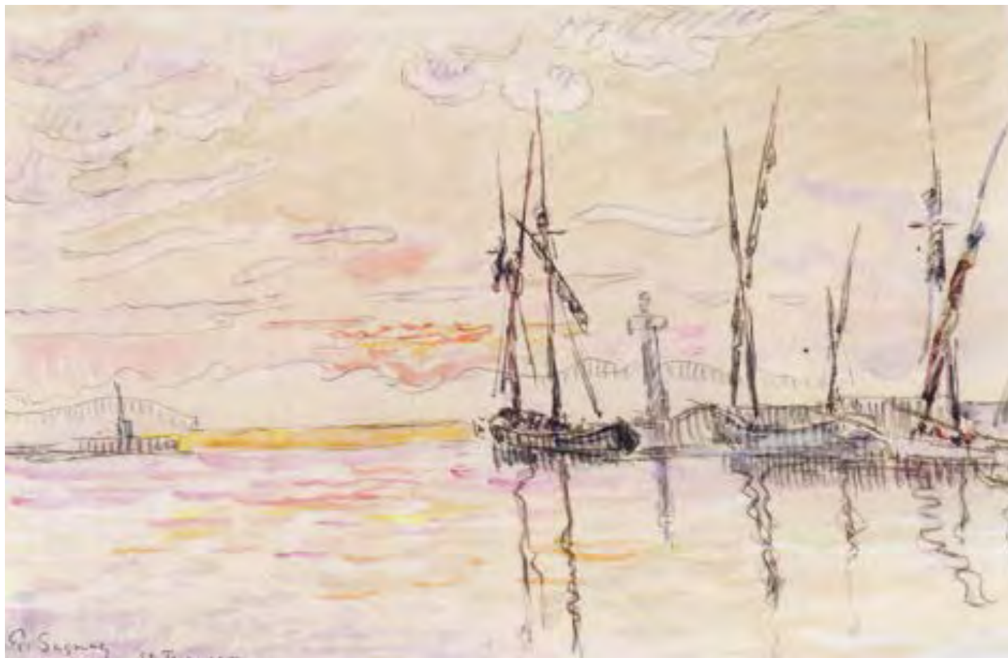
Paul Signac, St. Tropez , 1918 Watercolor and crayon on wove paper, 10 5/8 x 16 in. Signed in pencil, lower left: P Signac St. Tropez 1918, National Museum of Wales; Miss Gwendoline E. Davies Bequest, 1951 (NMWA 1710)