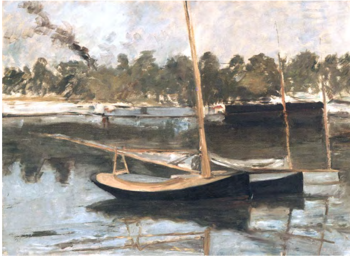
Edouard Manet Argenteuil-Boats , 1874 Oil on canvas, 23 x 31 1/2 in. National Museum of Wales; Miss Margaret S. Davies Bequest, 1963 (NMWA 2467)