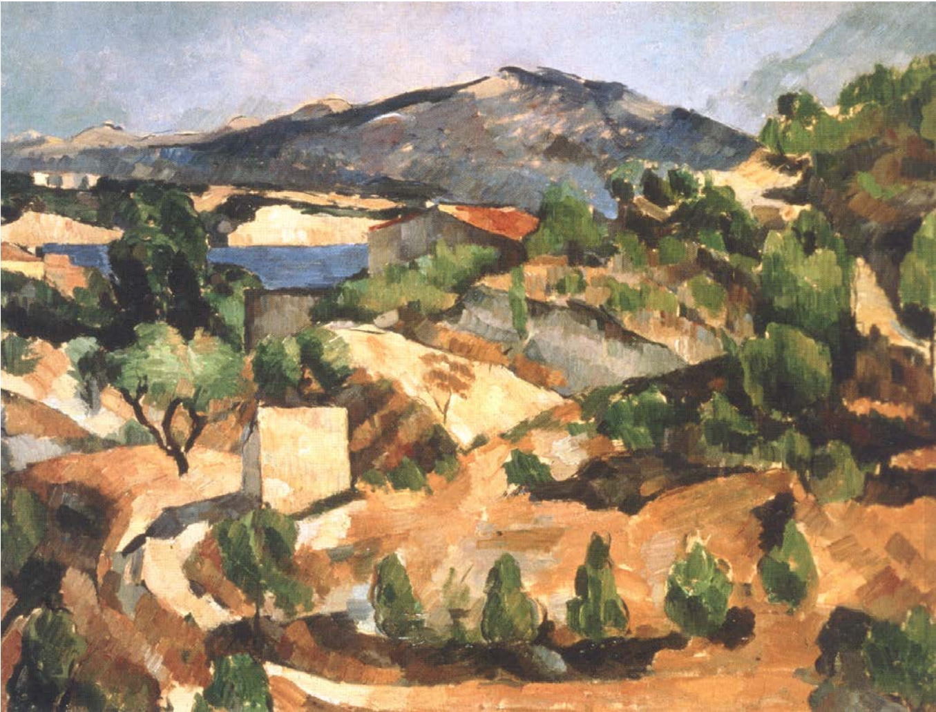
Paul Cézanne The François Zola Dam , ca. 1877–78 Oil on canvas, 21 3/8 x 29 1/4 in. National Museum of Wales; Miss Gwendoline E. Davies Bequest, 1951 (NMWA 2439)