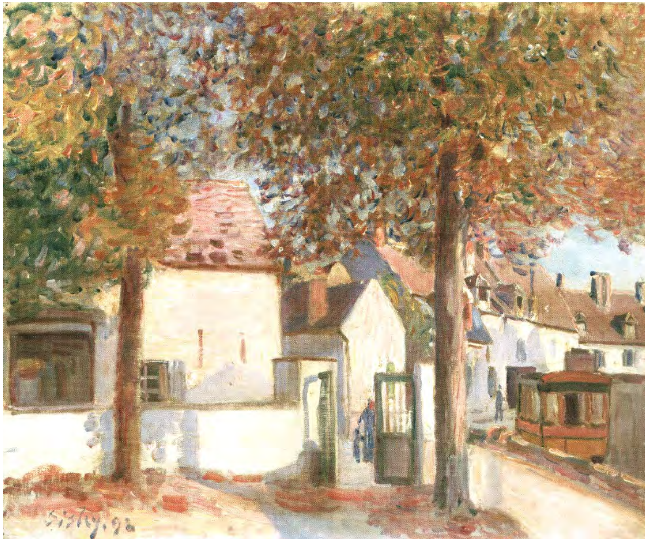
Alfred Sisley Moret-sur-Loing (Rue de Fosses) , 1892 Oil on canvas, 15 3/8 x 18 3/8 in. National Museum of Wales; Miss Margaret S. Davies Bequest, 1963 (NMWA 2502)