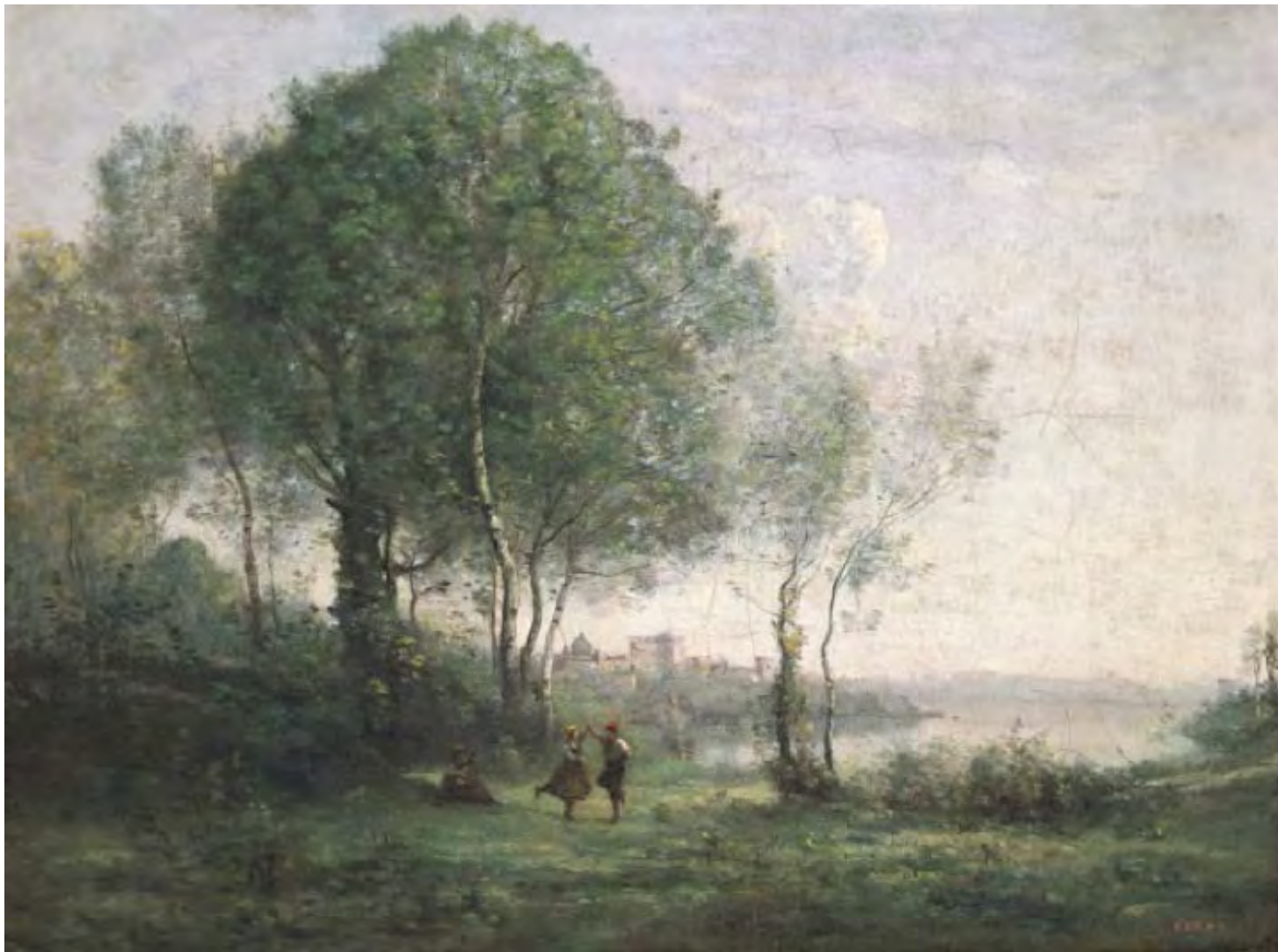
Camille Corot Castel Gandolfo, Dancing Tyrolean Shepherds by Lake Albano, 1855–60 Oil on canvas, 19 3/8 x 25 3/4 in. National Museum of Wales; Miss Gwendoline E. Davies Bequest, 1951 (NMWA 2443)