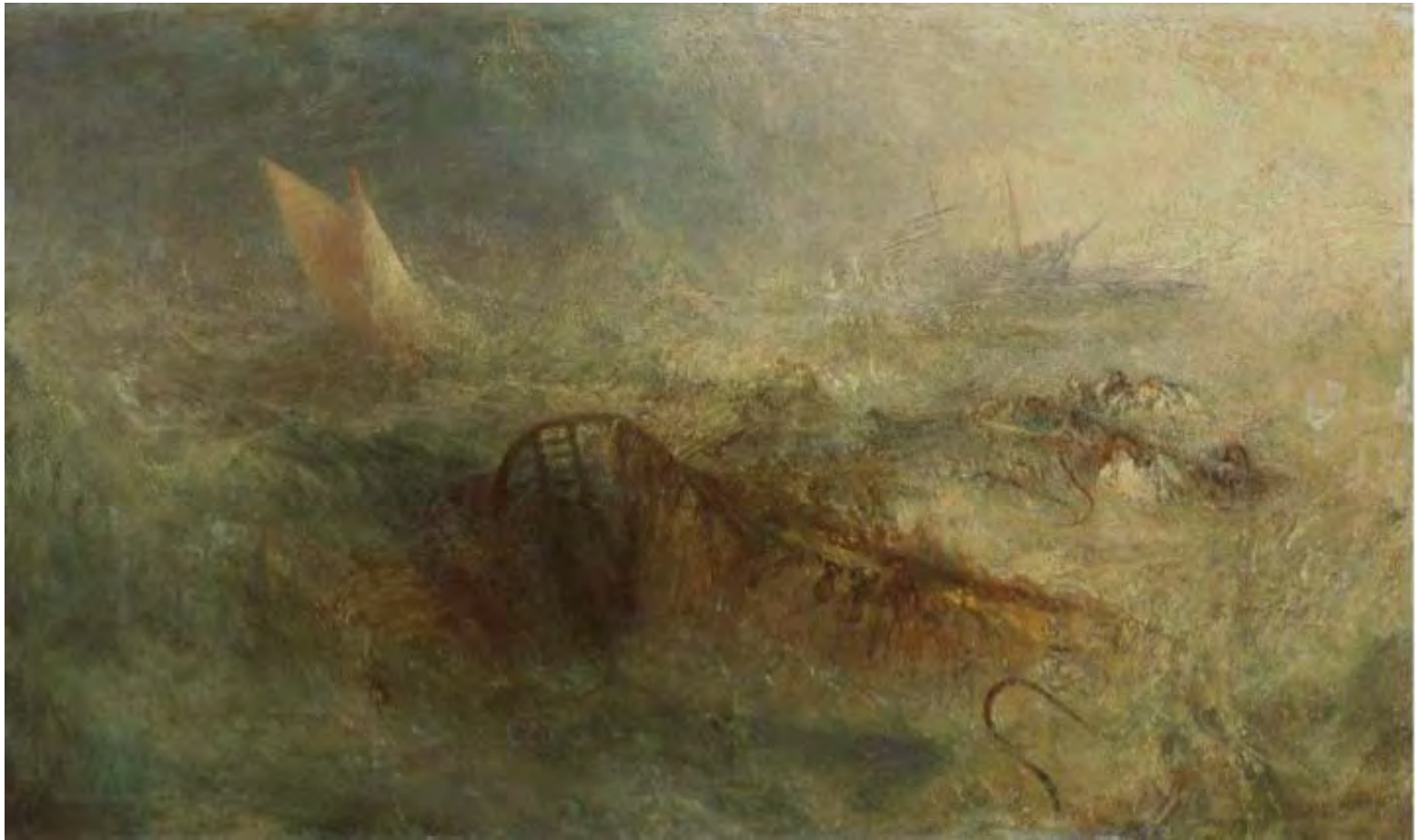
Joseph Mallord William Turner The Storm , ca. 1840–45, Oil on canvas, 12 3/4 x 21 1/8 in. National Museum of Wales; Miss Margaret S. Davies Bequest, 1963 (NMWA 509)