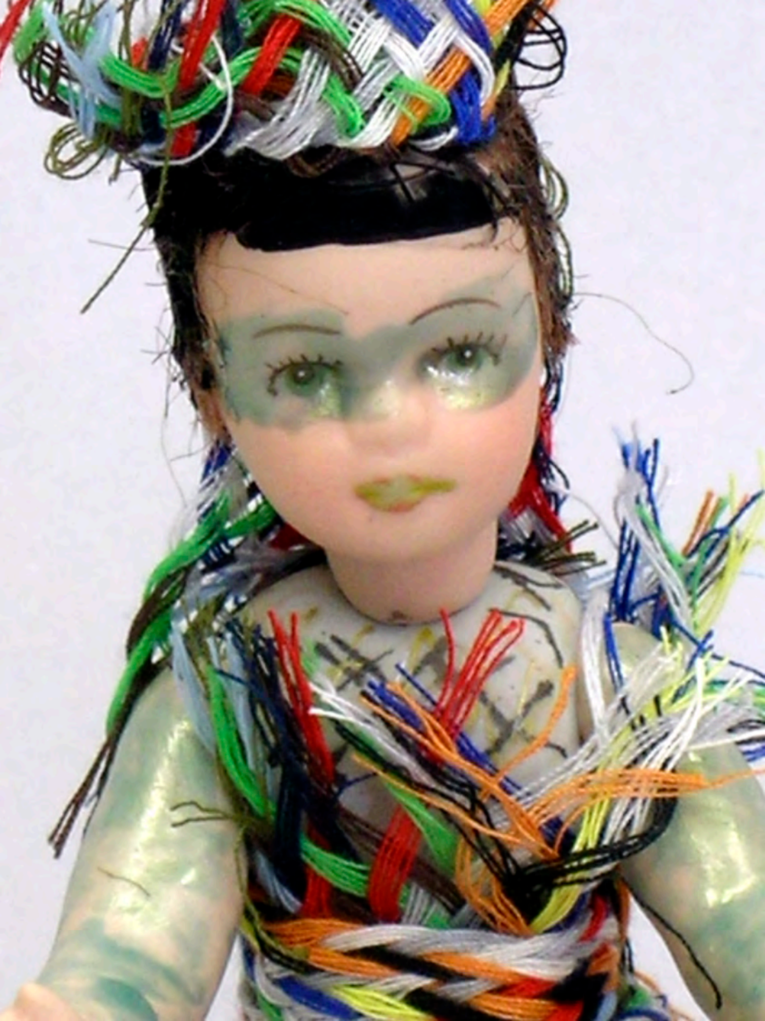
Claire Harootunian, Sewing Woman (close-up)