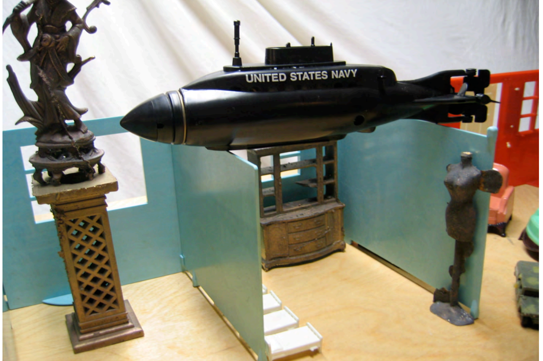
Gail Hoffman, Plasco Ranch (View 2)