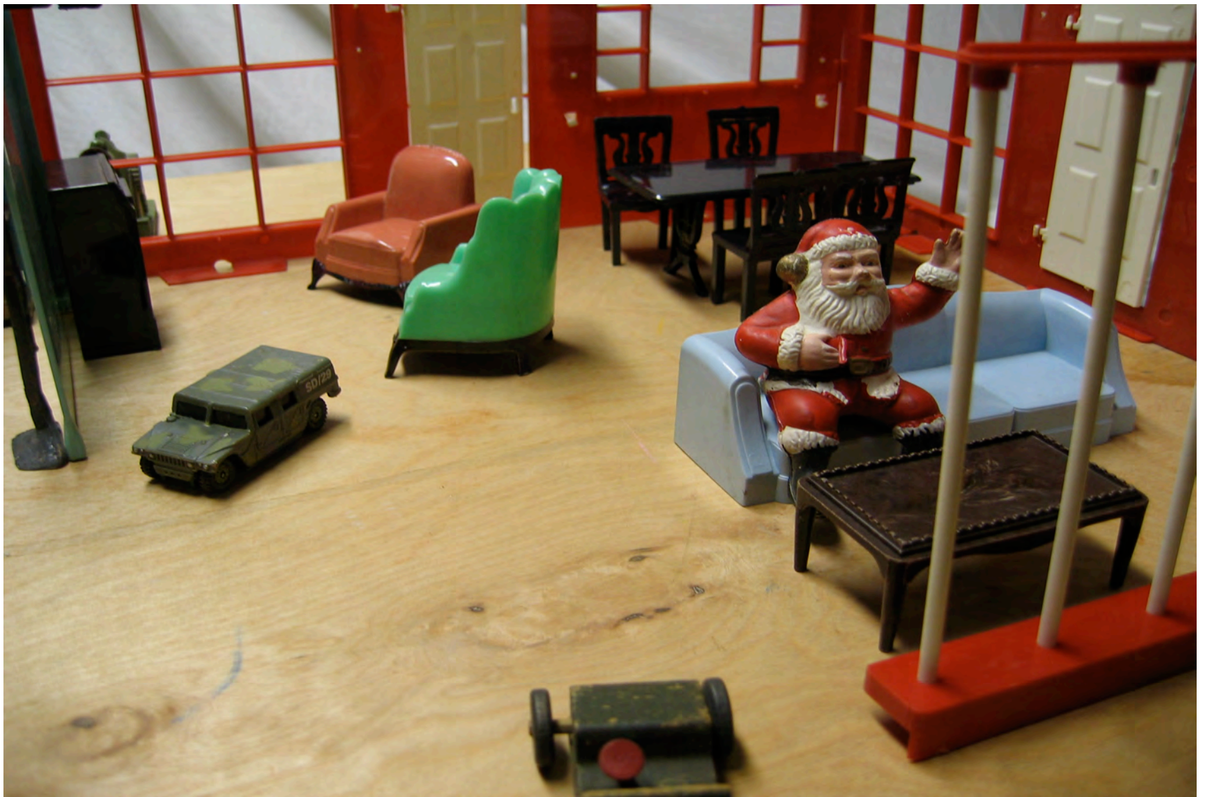
Gail Hoffman, Plasco Ranch (View 1)