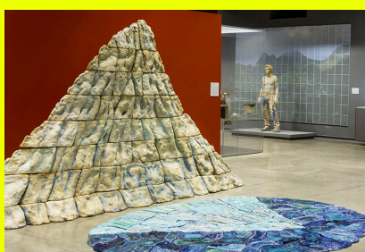
Clayscapes On view through October 20