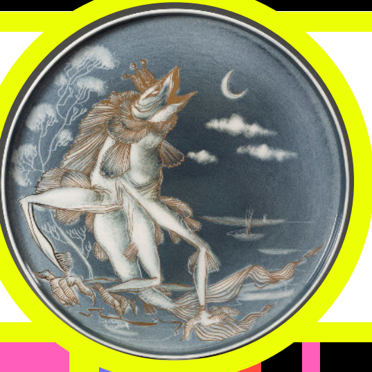
Sascha Brastoff: California King On view through December 29