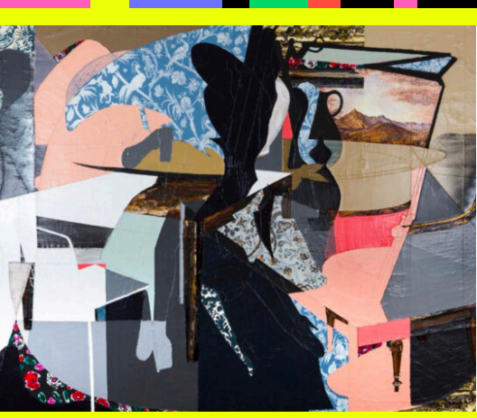
Off the Rack On view through December 29