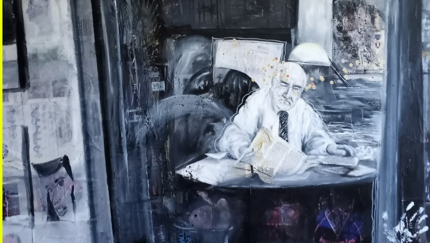
Tim Atseff: Final Edition On view through December 29