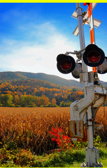
On My Own Time On view through November 10