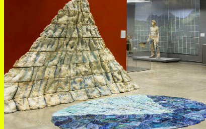
Clayscapes On view through October 20