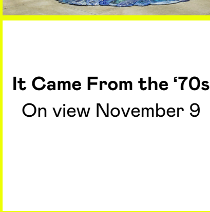
It Came From the '70s On view November 9