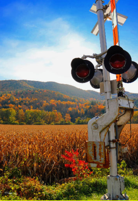
On My Own Time On view through November 10