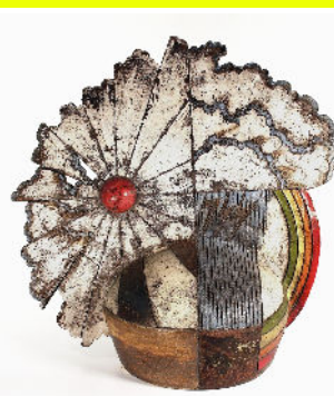
It Came From the '70s On view November 9