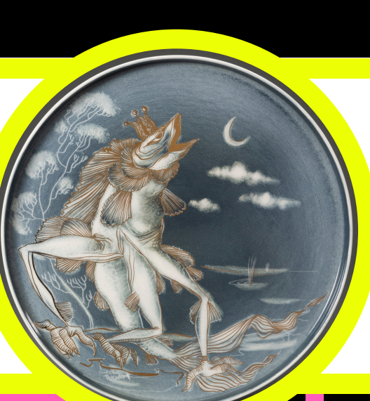
Sascha Brastoff: California King On view through December 29