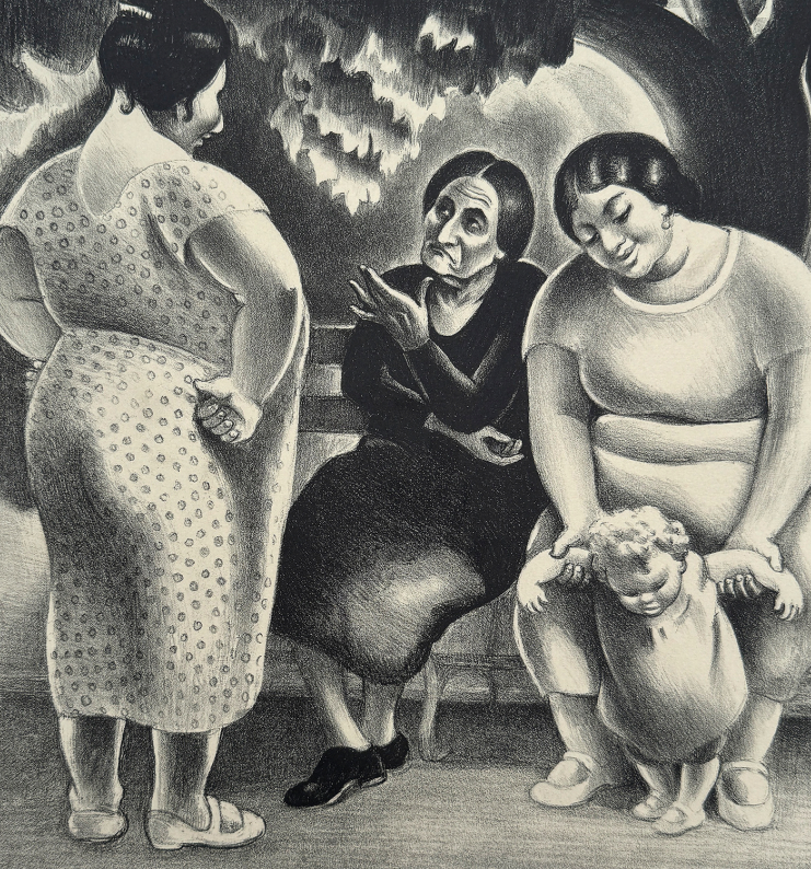
Putting Art to Work: Prints of the Works Progress Administration On view through December 29,