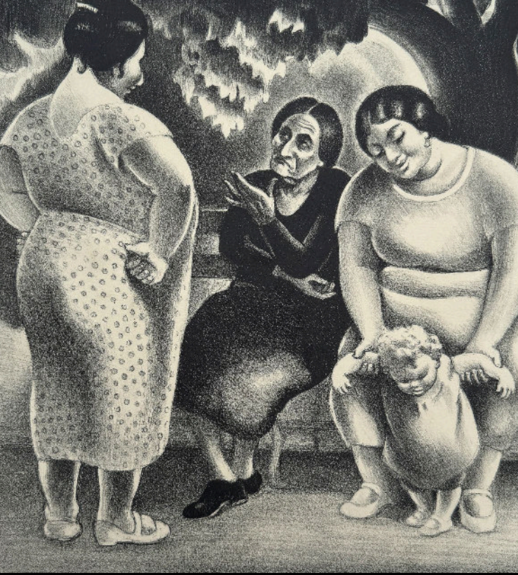
Putting Art to Work: Prints of the Works Progress Administration On view through December 29,