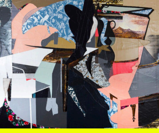
Off the Rack On view through December 29