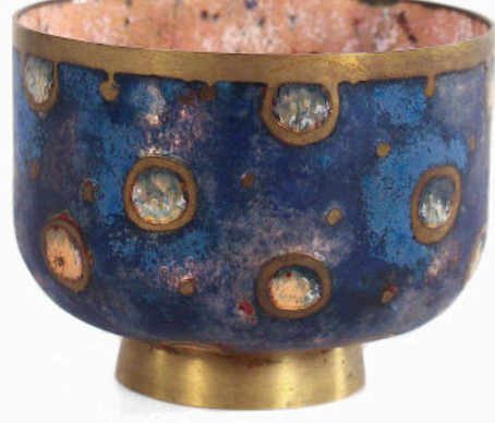
Jewels from the Fire: 20th Century Enamels On view through November 11